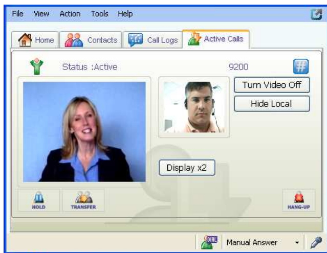
Call Window with Video Call